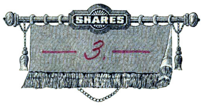
Wonderful Victorian share ornament from a 1904 stock certificate of the Baldwin & Rowland Switch & Signal Co.

Let's say collectors suggested their holdings were "worth $10,000." Estimates usually represent retail value. Collectors seldom tell their heirs to expect wholesale values when they sell. After all costs are considered, proceeds will probably end up being 50% to 70% of retail. That means heirs should probably expect to net $5,000 to $7,000 on $10,000 collections. (Add or subtract zeros as you desire.)