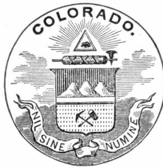
Modified Colorado state seal from bond of The Moffat Tunnel Improvement District

State codes generally prohibit exact reproduction of seal designs except for official state business. Nonetheless, state seals are strong and identifiable designs, so businesses often modify them for commercial use.