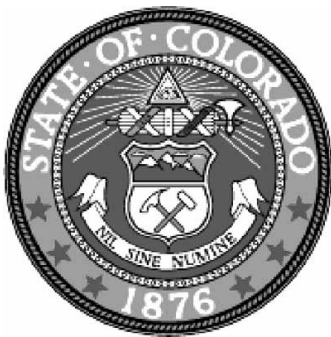
Official Colorado state seal

State seals are political in nature, so they are designed to represent qualities that states deem important. Some designs are quite complicated, given the small metal disk upon which the designs appear. However, codification of the designs is often more intricate than even the designs themselves.