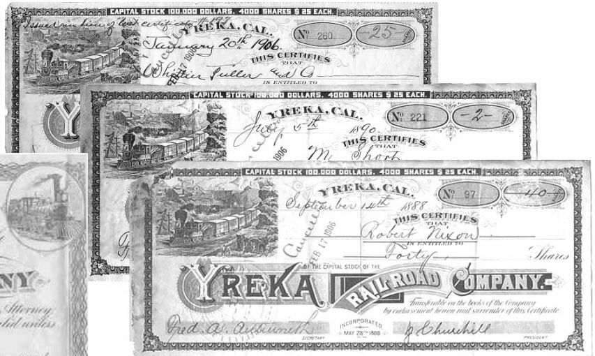
Certificates from recent internet sales. Several Yreka Railroad Co stocks (YRE-490-S-20) have appeared, both in fine and ratty conditions. At the left is a Central Rail Road Company of Minnesota stock (CEN-167-S-70.) Note the highly unusual placement of shares and serial number near the bottom.