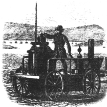
Engraving of the B&O's famous Tom Thumb locomotive. This image was used from about 1840 to the 1960s — probably the longest-running image used on American certificates.

From your viewpoint, though, the most obvious changes in the next edition will, of course, be the addition of new certificates. However, you will also see that I have completely revamped railroad names by adding key words such as "RR," "Ry," "Co," "Corp", and so forth.