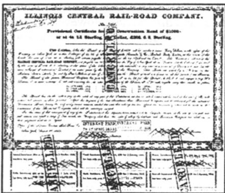
These blue Illinois Central bonds are common, but I suspect several more varieties exist.

R M Smythe & Co Scott Winslow & Associates Summit Auctions